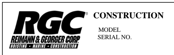
Figure 2-1. Typical HydraPak Product Nameplate

It is important to identify your HydraPak completely and accurately whenever ordering spare parts or requesting assistance in service. The HydraPak has a product nameplate that shows the model and serial numbers as shown in Figure 2-1. Record the model and serial numbers for future reference.