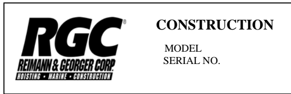
Figure 2-1. Typical HydraPak Product Nameplate

It is important to identify your HydraPak completely and accurately whenever ordering spare parts or requesting assistance in service. The HydraPak has a product nameplate that shows the model and serial numbers as shown in Figure 2-1. Record the model and serial numbers for future reference.