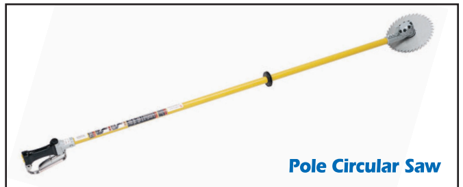
Pole Circular Saw