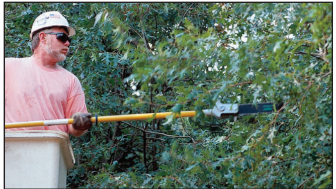
Pole Chain Saw