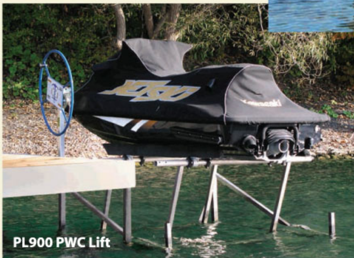
PL900 PWC Lift