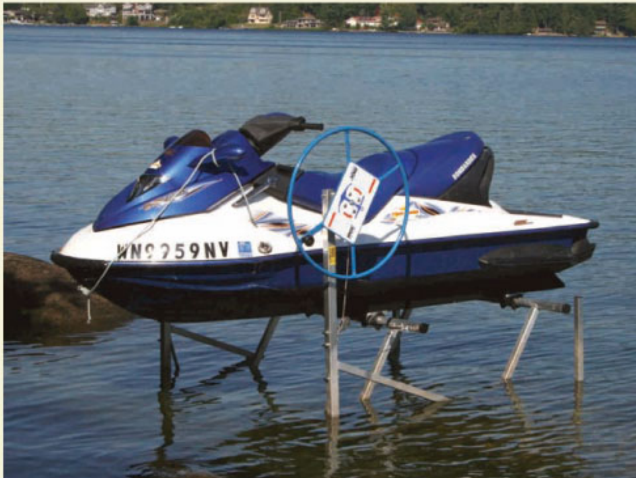
PL900 PWC Lift