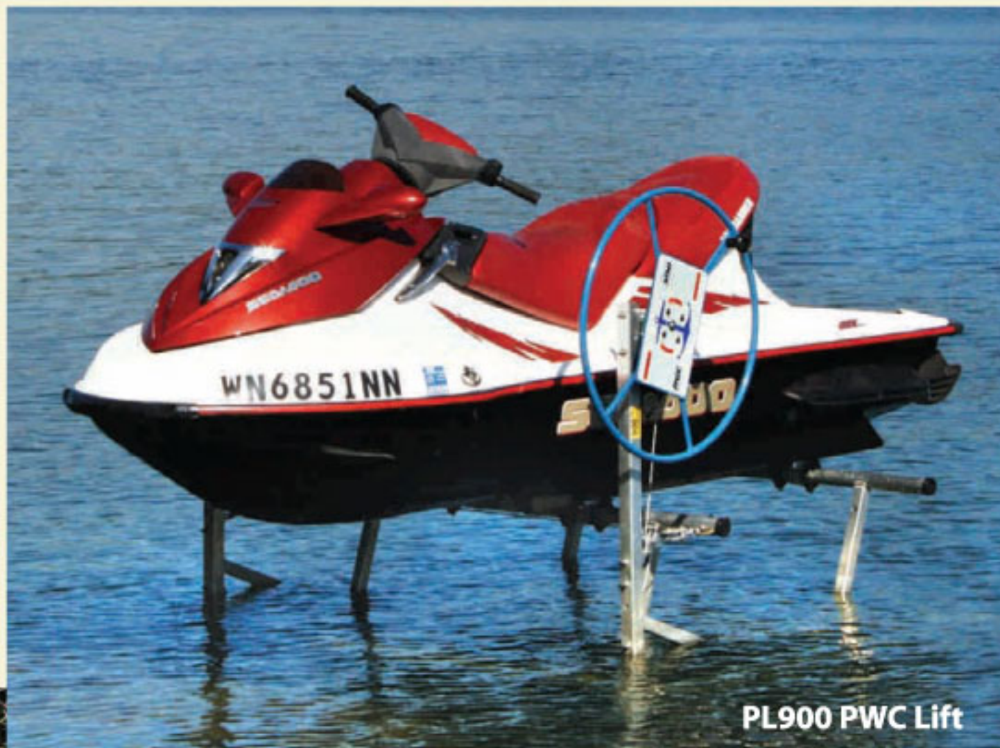
PL900 PWC Lift

Customize your PWC lift with Extension Legs, AC or DC Friction Drives, Winch Extensions and Single to Double Conversion Kits.